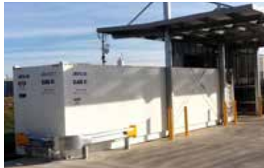
Transport Refuelling, Australia