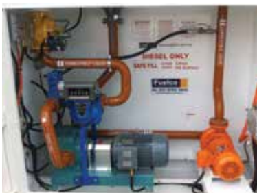
UNLOADING & DISPENSING