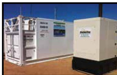
Back-up Power, Australia