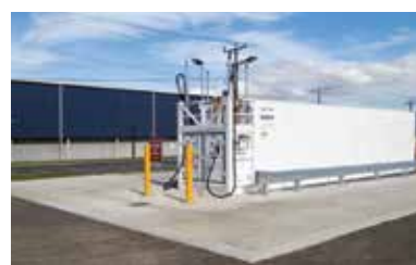
Unmanned Refuelling, Australia