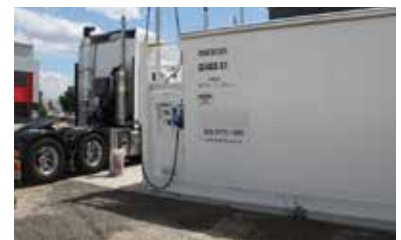
Transport Refuelling, Australia