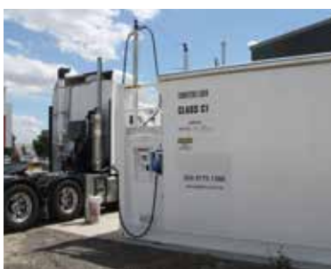
COMBO DEF TANKS