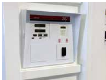
FUEL MANAGEMENT (FMS)