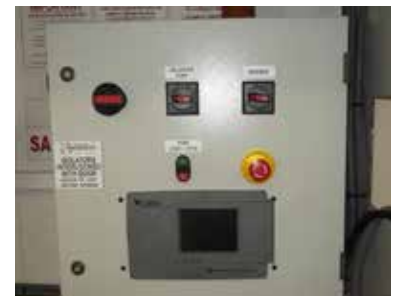
AUTOMATIC TANK GAUGING