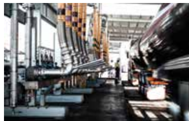
Bulk Lube Farm, Australia