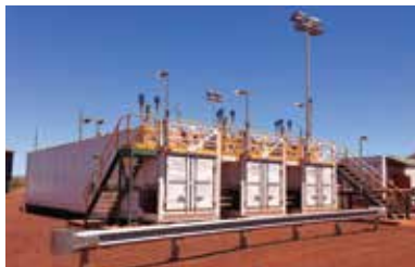
Mining Site, Australia