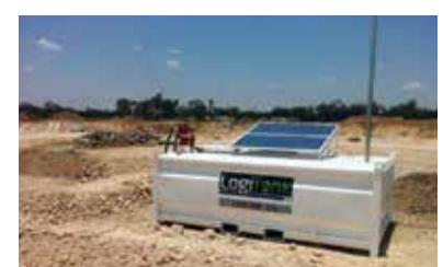
Solar Tank System, Australia