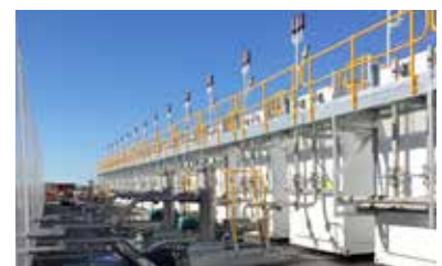
Bulk Fuel Farm, Australia