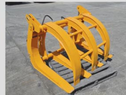
Hydraulic Log Grapple