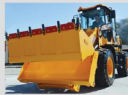
Heavy Duty 4-in-1 bucket